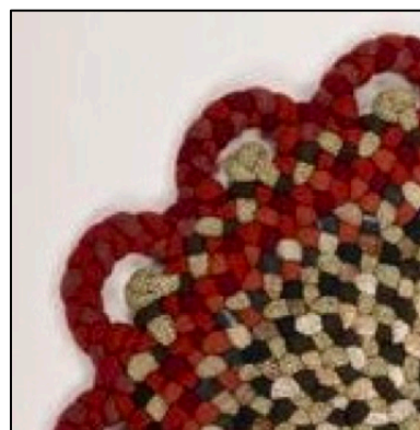
The Knotted Arches border is made of two rows: the knot row, and the arches row.